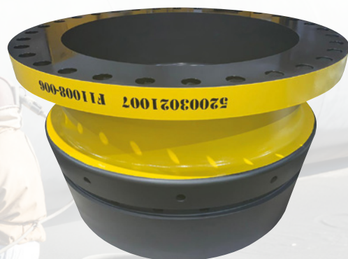
Subsea component with Zinc Phosphate, Everslik and 2 coat Epoxy