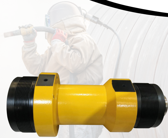
Subsea component with Xylan coated external threads and 3 coat epoxy on main body