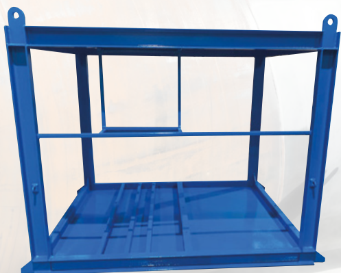
Frame with 2 coat Epoxy